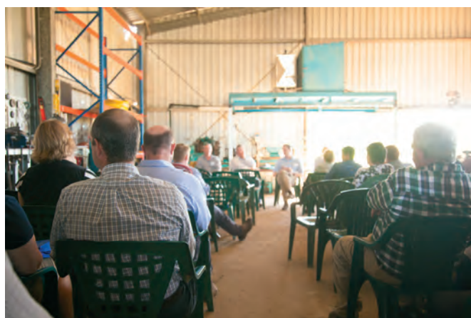
Representatives from Australian Dairy Farmers and QDO speak with farmers at the Maleny Dairy event in June.