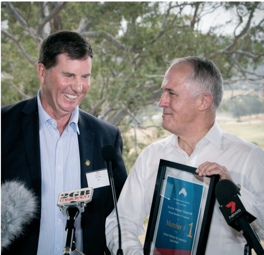
Prime Minister of Australia Malcolm Turnbull MP and NFF President Brent Finlay at our digital transformation launch in December 2015. Location: Menangle, NSW.

The Murray-Darling Basin continued to be a high priority; with the NFF and members managing to secure $15 million in funding for the Carp Herpes Virus and to amend the Water Act 2007 which would cap water buybacks at 1500GL.