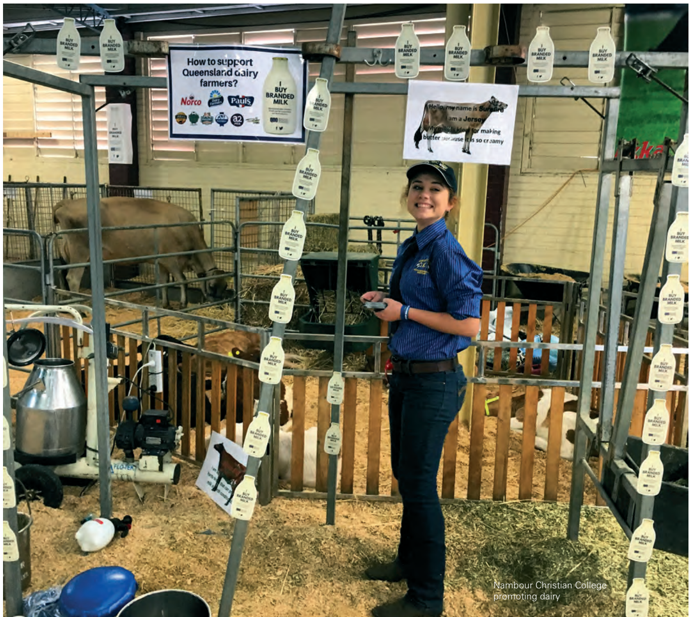
Nambour Christian College promoting dairy

QDO supported Australian Dairy Farmers and other small business advocacy groups in lobbying the Federal Government to commit to introducing the effects test into the Competition and Consumer Act to extend unfair contract protection laws to cover small business.