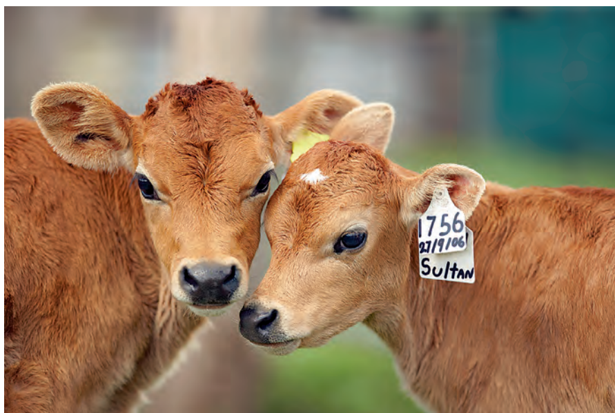
The dairy industry has committed to phasing out calving induction.

Australian Dairy Farmers and Dairy Australia are working with farmers, veterinarians, State Dairy Farmer Organisations, processors and other stakeholders, to ensure the calving induction phase-out achieves the best animal health and welfare outcomes possible, and that affected farmers are communicated with and assisted as actively as possible.