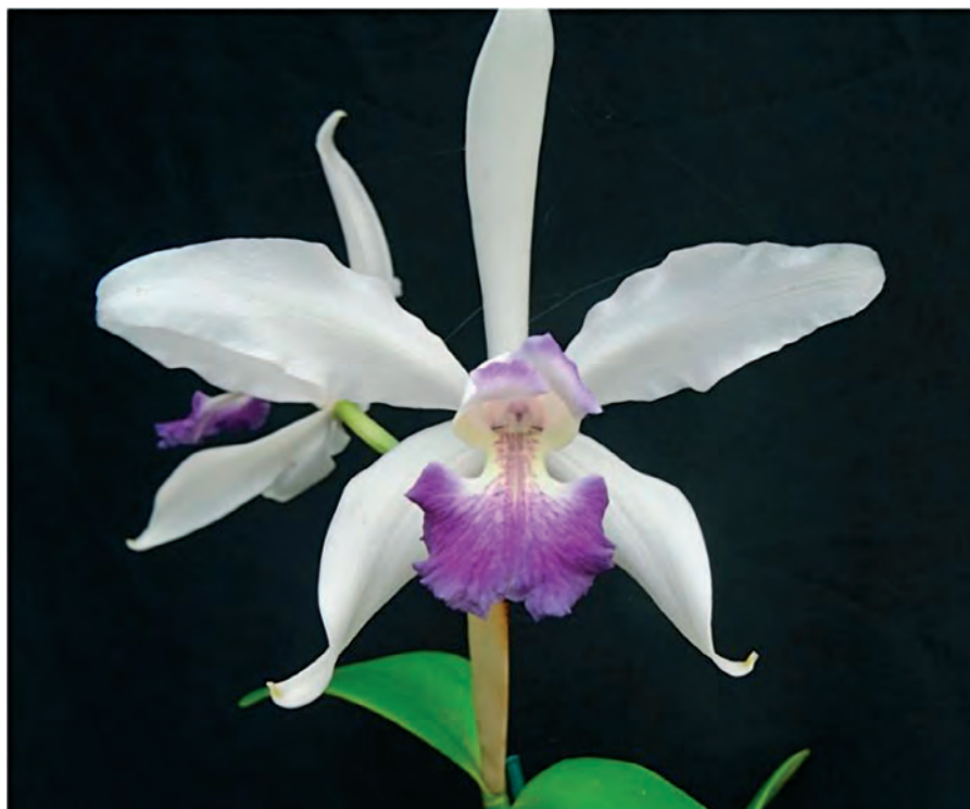
Cattleya orchid named Howard's Delight

The nature of dairy farming has often meant buying or leasing neighbouring properties, requiring cattle to cross a road to get to the milking sheds several times a day. In the memorandum of understanding signed with the NSW Liberal and National parties before the 2015 election, the association was able to secure a commitment from the government for the development of a cattle underpass scheme. Our farmers in NSW were surveyed to ascertain what locations would benefit from a cattle crossing. A working group led by the NSW Department of Primary Industries was formed and involved key stakeholders: NSW Farmers; Department of Premier and Cabinet; Treasury; Roads and Maritime Services; and Transport NSW. NSW Farmers continues to assist this taskforce by providing specific coordinates so that other members of the taskforce can model the crossing types and cost estimates. Work will continue on the development of this scheme.