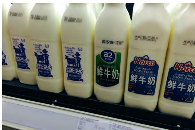
Australian milk in a supermarket in China